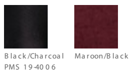
Black/Charcoal PMS 19-40 06